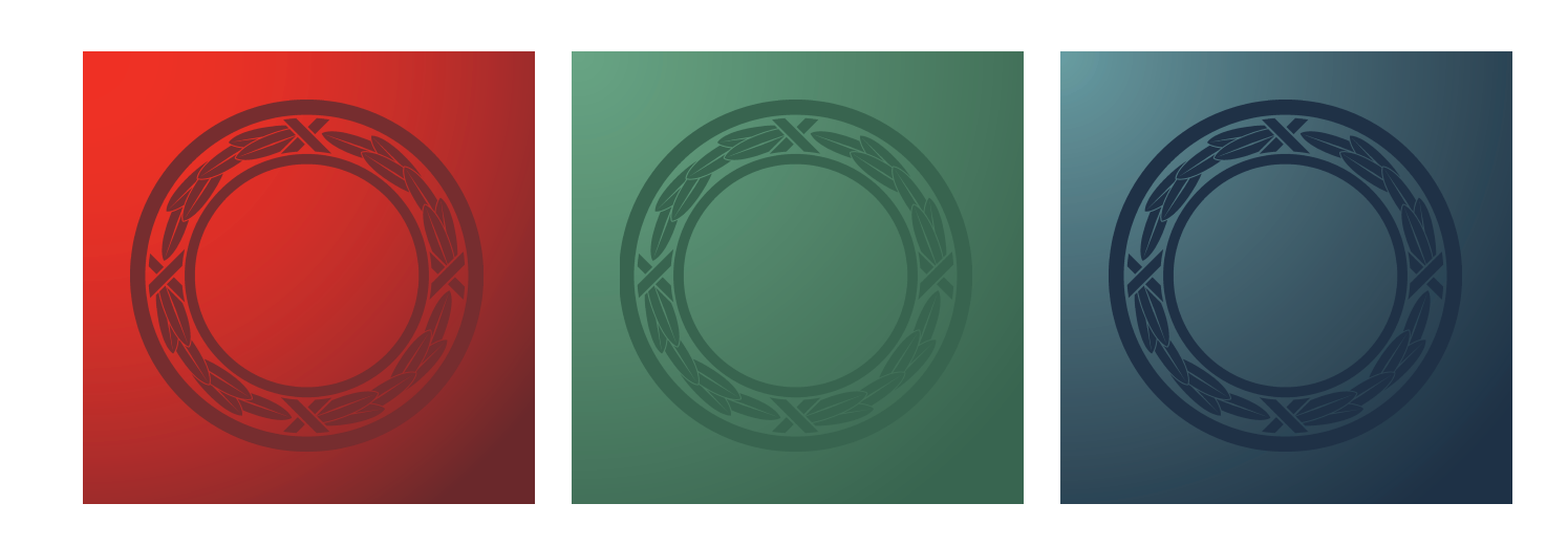
Annual Report and Accounts 2014/2015